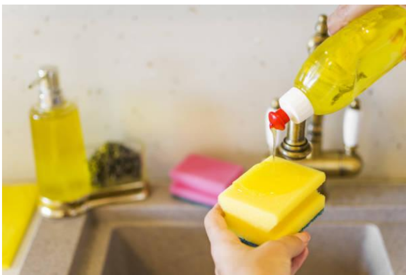
Table 2.6: Dish washing liquid formula 1.

Dishwashing liquid, also known as dish soap or dish detergent, is a liquid detergent used for washing dishes. It's formulated to effectively cut through grease and food residue, allowing for thorough cleaning of dishes, glassware, and utensils.