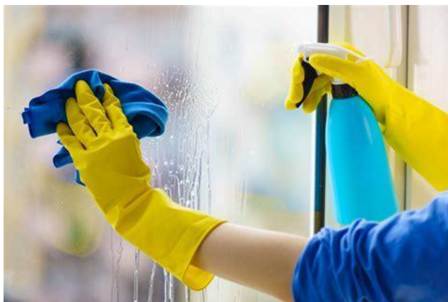
Table 5.1: Glass cleaners 1.

Window cleaner are detergents that are used to clean dirt from glassy material used in homes, industries, institution or on the vehicles. They are normally produced as gel or liquid.